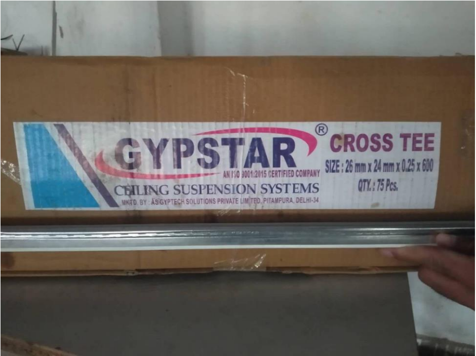
Picture 2: Gypstar Ceiling Suspension System, Main Tee and Cross Tee